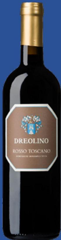
TUSCAN RED IGT

Our IGT wines (Indication of Typical Geographic area) have a lively and young personality. They represent the innovative side of our portfolio. Being fresh and easy-drinkable products, they are a must-have for summer evenings, aperitifs and parties.